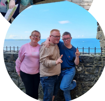
Bolster Buddies enjoyed lots of fun and laughter at their North Coast residential in September!

Support our SILENT DISCO and grab yourself and friends a ticket! Our Eventbrite link is on our social pages or buy tickets at Bolster HQ.