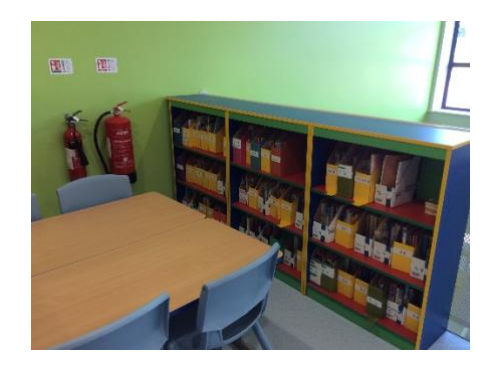
EA Literacy Support