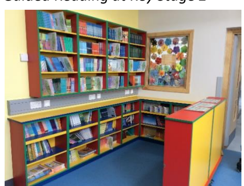
range of genre.